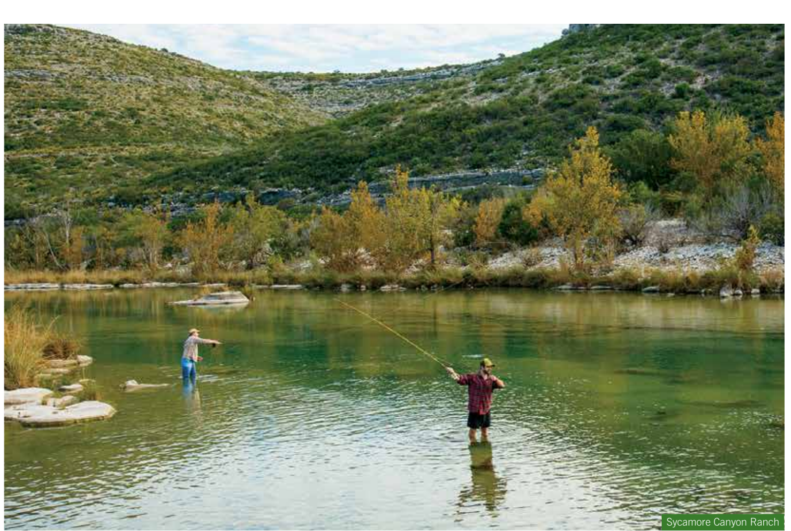
Sycamore Canyon Ranch

Working lands are the lifeblood of Texas. TALT's partners represent a cross-section of Texas' working lands. They are cattle ranchers and farmers. Some have hunting and fishing operations; others - mitigation banks and education facilities. They manage generational family ranches and recreational weekend retreats. We salute these Texans for their commitment to the working lands we love!