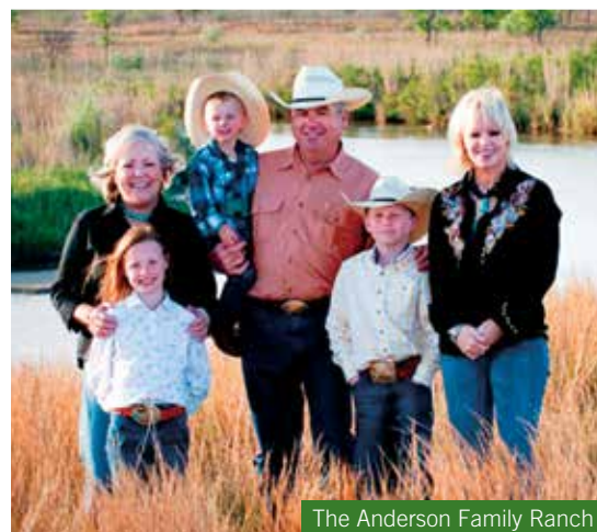
The Anderson Family Ranch