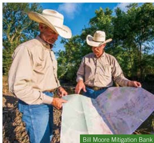
Bill Moore Mitigation Bank