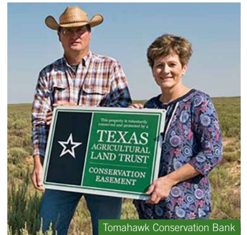
Tomahawk Conservation Bank

Working lands are the lifeblood of Texas. TALT's partners represent a cross-section of Texas' working lands. They are cattle ranchers and farmers. Some have hunting and fishing operations; others - mitigation banks and education facilities. They manage generational family ranches and recreational weekend retreats. We salute these Texans for their commitment to the working lands we love!