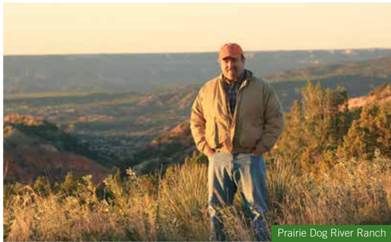
Prairie Dog River Ranch