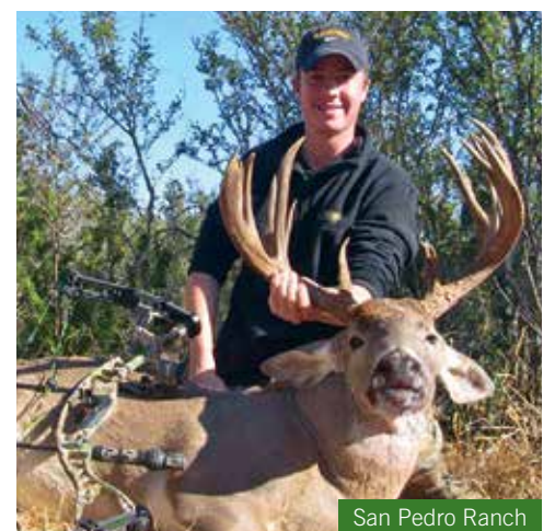
San Pedro Ranch